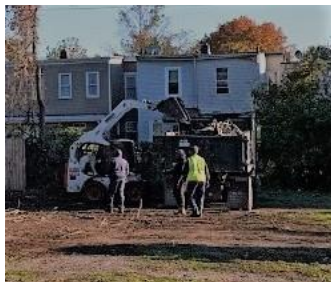
Clearing Land on Tyrell Ave

The Tyrell Redevelopment Project is helping to transform an entire Trenton block with new and rehabbed low-income homes, while at the same time providing families with programs and events that widen their horizons and teach a mindset of personal and community responsibility and awareness. We thank all of you for your patience as we deal with delays caused by COVID, as well as changes in city administration and regulations.