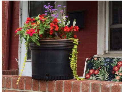
Flowers on a Stoop - Tyrell Ave