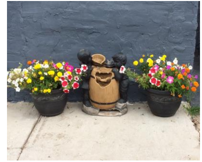
Grouping of Planters on Tyrell Ave