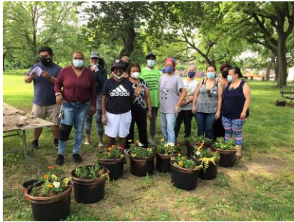
Planter Day at George Page Park

Residents of East Trenton gathered on May 22 to make their own personalized planters for their front stoops. Planter Day was brought back for the second year by popular demand. Better Community Housing of Trenton provided supplies and instructions for the residents, who designed their own planters and later proudly showed them off on their a tour of their stoops. The East Trenton Collaborative helped organize the event at George Page Park.