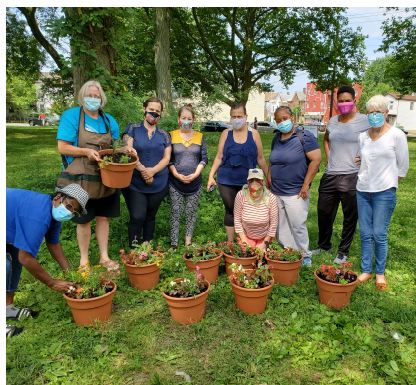
Results at George Page Park