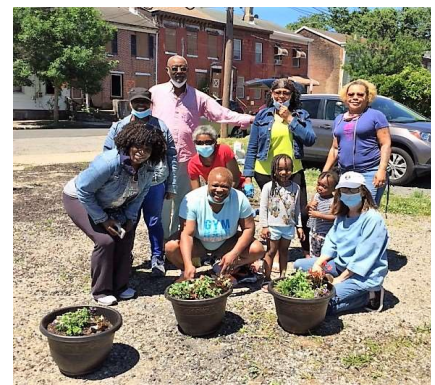
Results on Tyrell Ave