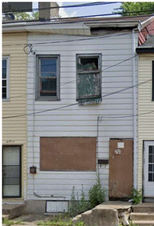
42 1/2 Tyrell Ave

On August 5, following a long application process, the Trenton City Council approved Better Community Housing of Trenton's plan to redevelop a portion of Tyrell Avenue. This project, with other initiatives, will transform an entire block with new and rehabbed homes, and at the same time provide low-income families with programs and events that widen their horizons and teach a mindset of personal and community responsibility and awareness. (See events articles on Planters... and Open Streets... )