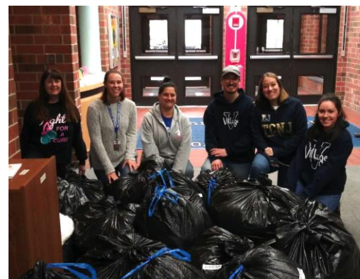
Coat Drive at West Windsor elementary schools