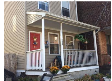
A 'Beautified' House on E State St.