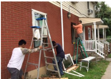
Installing New Windows